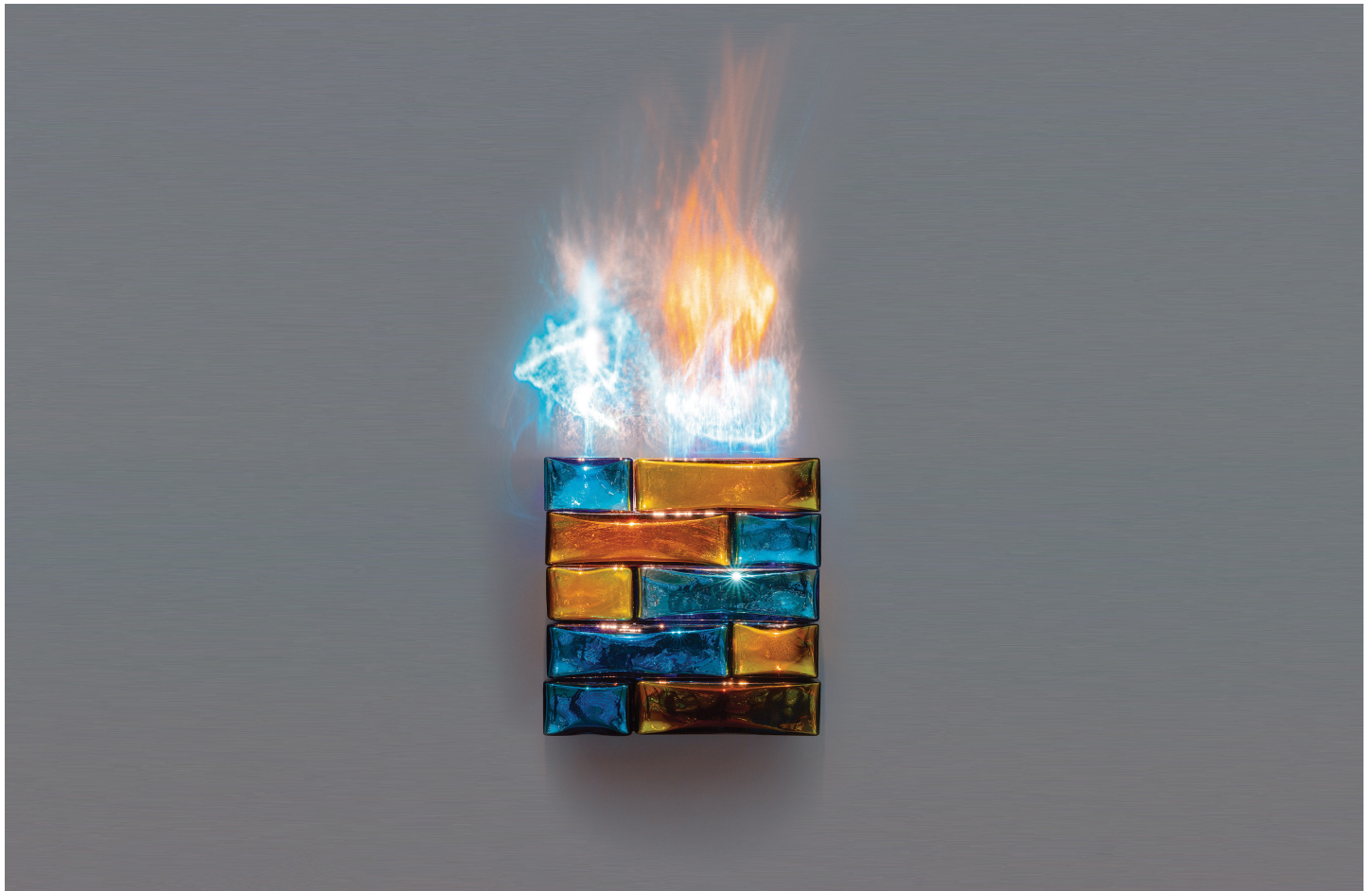
Exhibition view of Precious Stonewall (#9), 2021. Sculpture: Blue and amber Indian mirrored glass, wood. 33 x 32 x 22 cm. Photo : Claire Dorn. Courtesy of the artist & Perrotin. © Jean-Michel Othoniel / ADAGP, Paris, 2022