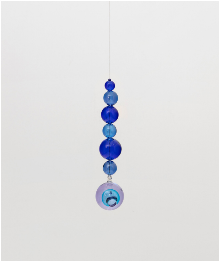
Suspended Lover Alessandrita, Aquamarine and Cobalt, 2021. Murano glass alessandrita, aquamarine and cobalt, stainless steel. 70 × 15 × 15 cm.

Othoniel's suspended knot seems to connect the infinitely small to the infinitely large, suggesting a mutual and fluid relationship between them. Curved and sensual, it also recalls the imaginary gesture of a calligrapher whose writing would have crystallized in the air.