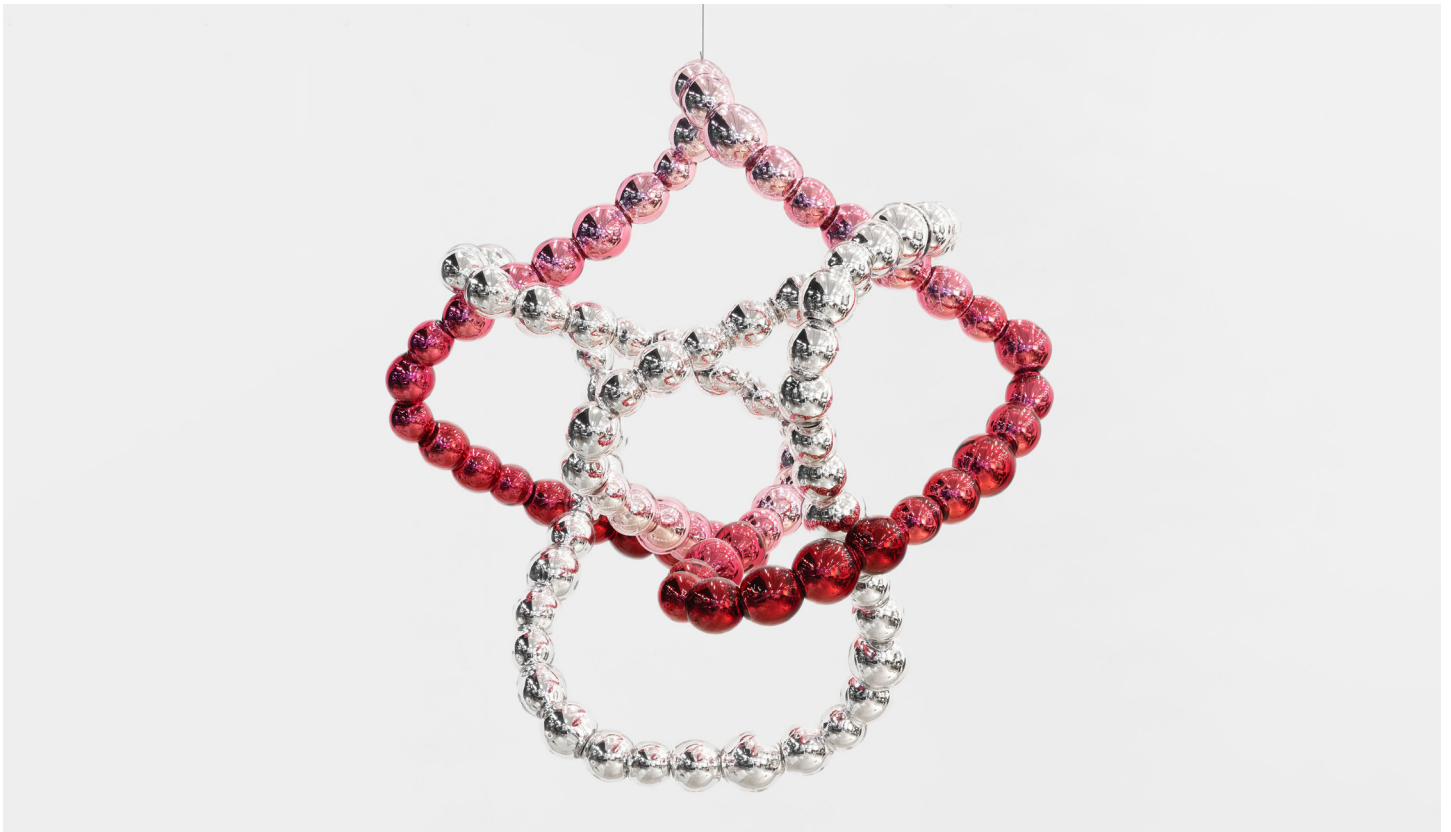
Wild Knot , 2021. 90 x 90 x 90 cm. Mirrored glass, stainless steel. Photo: Claire Dorn. Courtesy of the artist and Perrotin. © Jean-Michel Othoniel / Adagp, Paris, 2022.