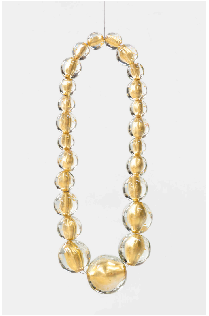
Collier Or, 2019. 穆拉诺玻璃、金箔 | Murano glass, gold leaf. 125 x 45 x 18 cm | 49 3/16 x 17 11/16 x 7 1/16 in. © Jean-Michel Othoniel / ADAGP, Paris & SACK, Seoul 2019.

创作过程的产物。这启发了欧托尼耶利用玻璃的柔韧和脆弱来隐喻人类的身体和生命之有限性。玻璃如同人的身体一样，美丽却易受损。欧托尼耶的雕塑承载了玻璃技师的身体痕迹，因为玻璃由他们组合、粉碎及触摸——某种程度上来说，刻意保留了玻璃受损或不完美的一面。欧托尼耶时常会被邀请创作场域限定的作品，从而与历史古迹和当代建筑之间产生互联。他也多次与建筑师合作，包括与彼得·马里诺 (Peter Marino) 合作为香奈儿进行建筑设计，并与尚·努维尔 (Jean Nouvel) 合作进行其他项目。欧托尼耶的雕塑已于全球各大机构展出，重要个展举办于意大利威尼斯的佩姬·古根海姆美术馆、日本东京的原美术馆、纽约的布鲁克林博物馆以及法国巴黎的蓬皮杜艺术中心等。