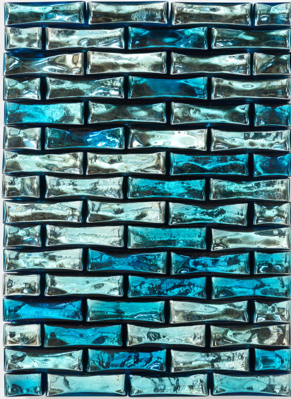
Precious Stonewall , 2019. 镜面蓝色玻璃 | Mirrored blue glass. 104 x 77 x 22 cm | 40 15/16 x 30 5/16 x 8 11/16 in. 摄影 | Photo: Claire Dorn. © Jean-Michel Othoniel / ADAGP, Paris & SACK, Seoul 2019. 图片提供: 艺术家与贝浩登 | Courtesy of the Artist and Perrotin