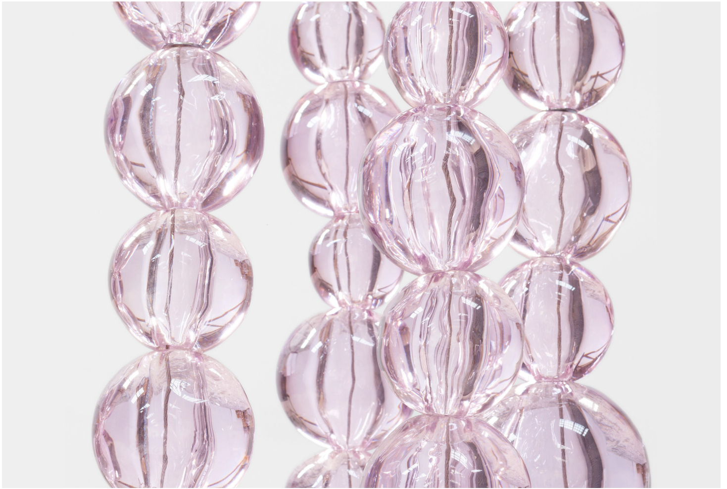
Double Collier Rose (局部 / detail), 2019. 粉色穆拉诺玻璃 | Pink Murano glass. 320 x 40 x 40 cm | 126 x 15 3/4 x 15 3/4 in. © Jean-Michel Othoniel / ADAGP, Paris & SACK, Seoul 2019.