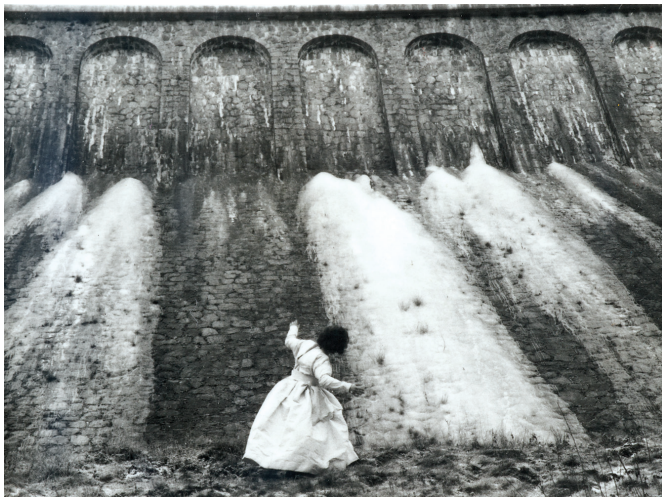
Jean-Michel Othoniel , Self-portrait in priest's vestments , 1986. Black and white photography. Artist private collection.