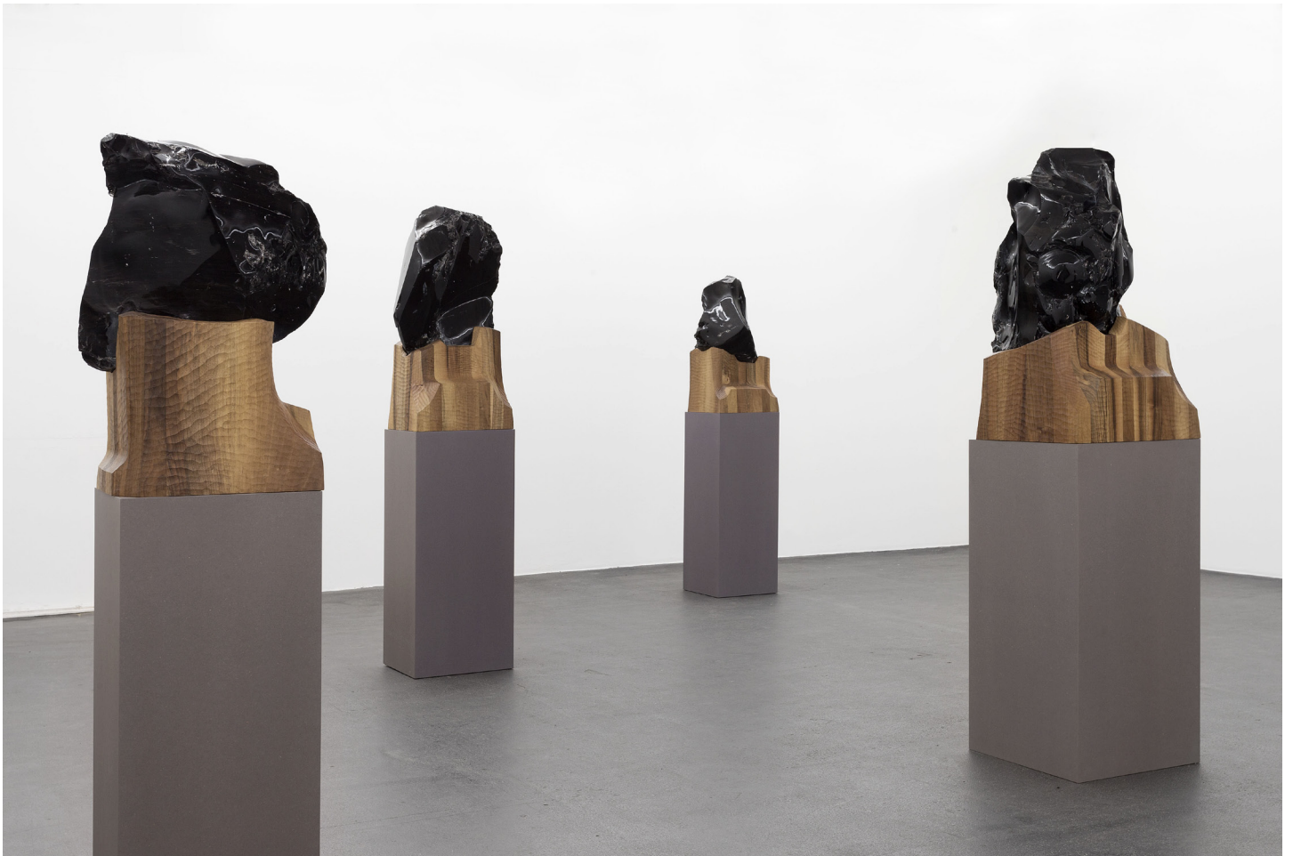
Jean-Michel Othoniel , Invisibility Faces , 2015. Obsidian, chestnut wooden base. Artist private collection.