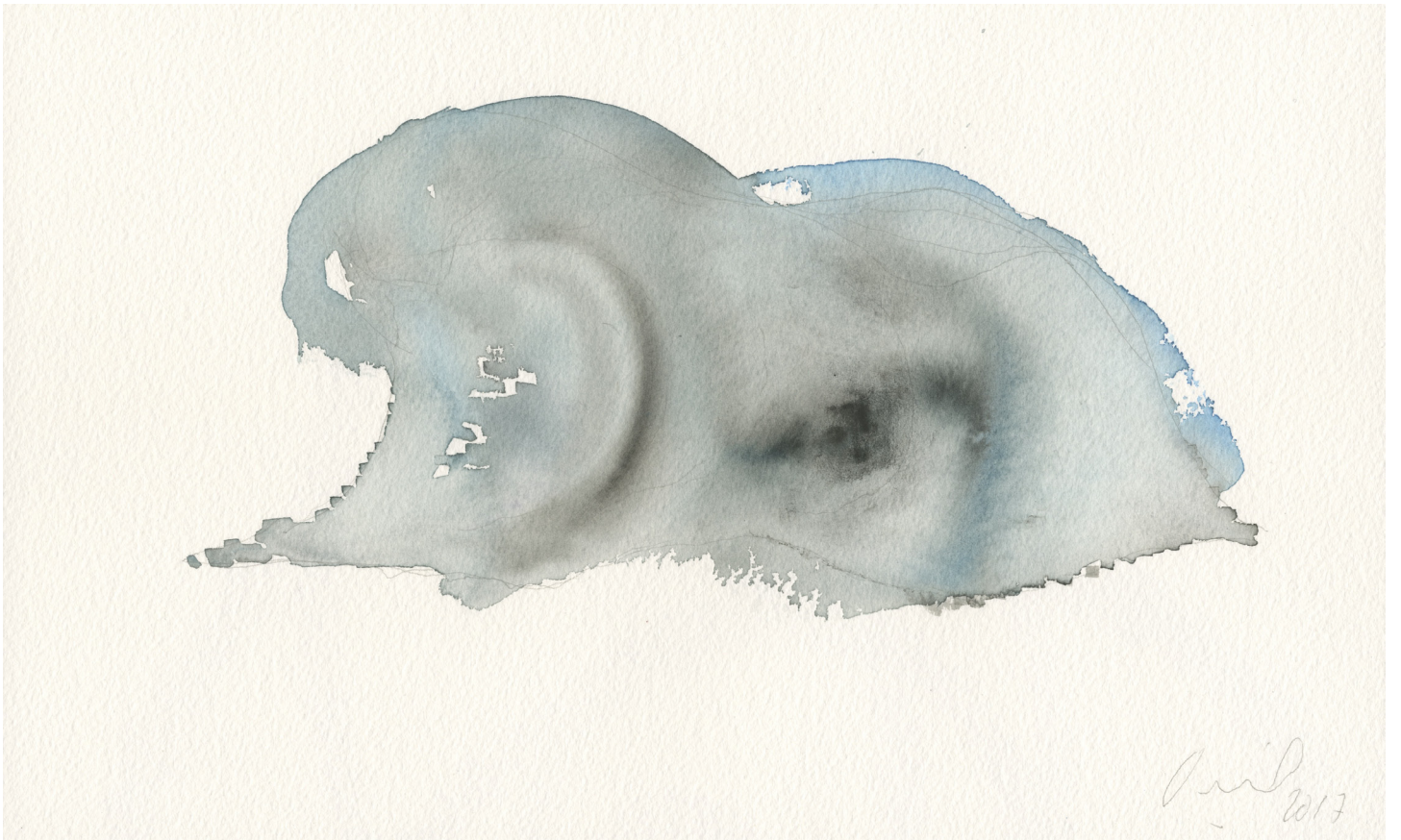
Jean-Michel Othoniel , The Big Wave (détail), 2017. Watercolor on paper. Artist private collection. © ADAGP, Paris 2018.