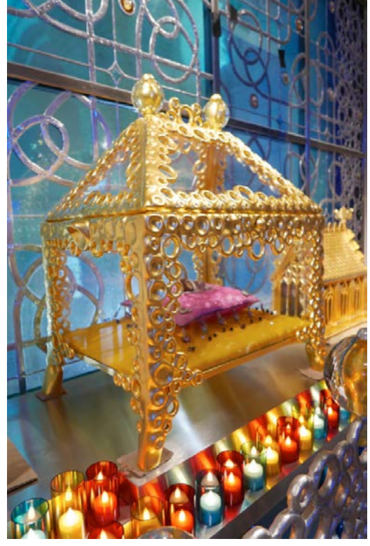
One of about 200 liturgical objects and vestments on display.