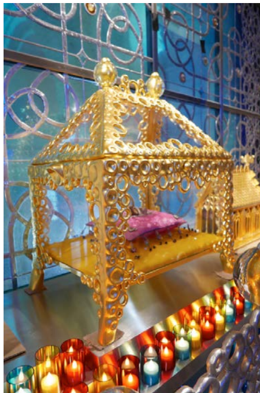
One of about 200 liturgical objects and vestments on display.